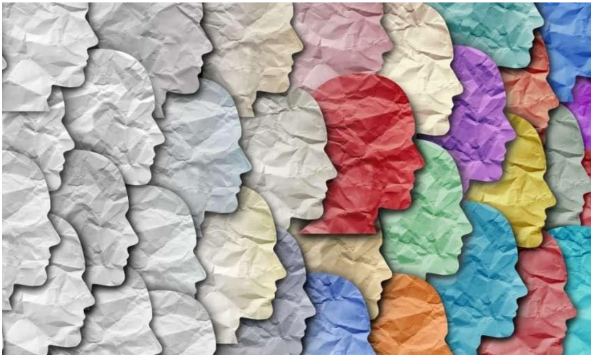
4 - General Long Term conditions.