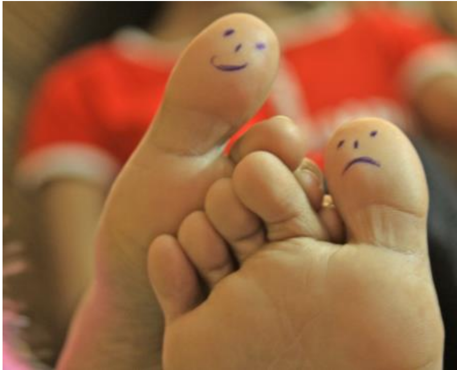
13 - Foot Health Education