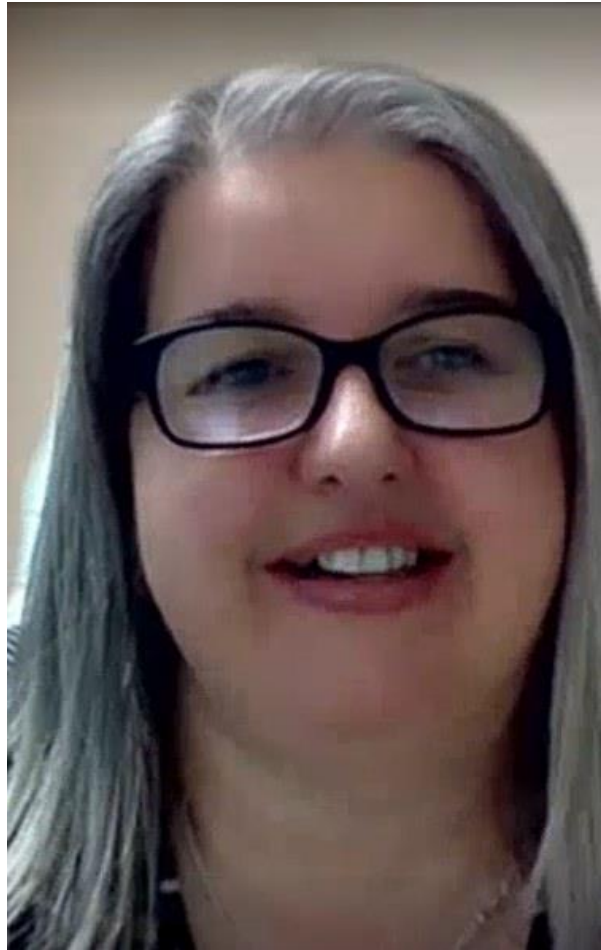
1 - Meet the team: -

can be contacted by phone on 03000 852280 / 03000 852281 or by e-mailing eppcymru.bcuhb@wales.nhs.uk . Course info can also be found on the Web site .