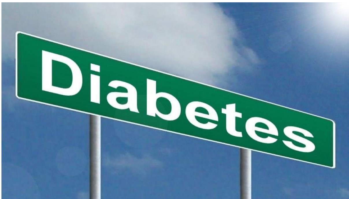
5 - Diabetes Self-management Courses

Eligibility criteria: 18 years old and over, living with symptoms for 6 months or more.